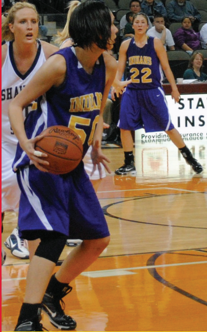
HINU women's basketball game.

TRIBAL Colleges & Universities: Educating, Engaging, Innovating, Sustaining, Honoring