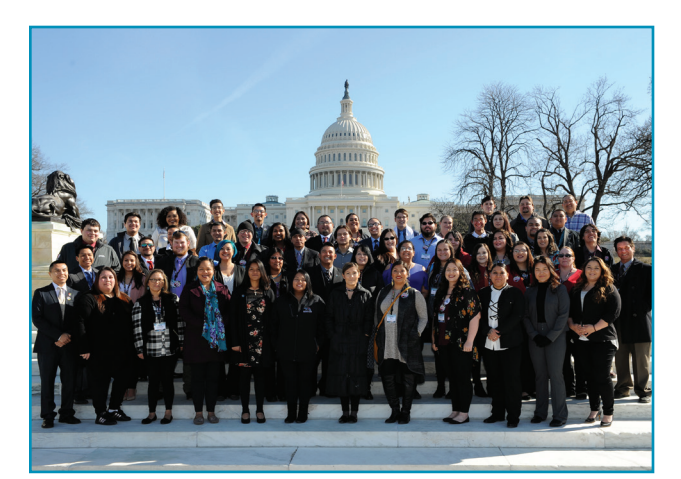
TCU students gather for the annual Capitol Hill meetings in Washington, D.C.

While the funding needs of TCUs are many, AIHEC is focusing its federal advocacy efforts on three priorities. (1) Honoring Treaties & Tribal Sovereignty: AIHEC is seeking that TCUs, and other tribal programs, be held harmless from Congressional across the board cuts to funding and further sequestration cuts; (2) Two-Part Plan for Parity: AIHEC is working to address the long-standing inequities in both TCU funding and participation in federal IHE programs, particularly in the land-grant system; (3) Uninterrupted Operations: Congress and the Administration should fully fund the Tribal College Act's basic operating grants for the first time in the Act's 40 year history. Less than $10M additional is needed.