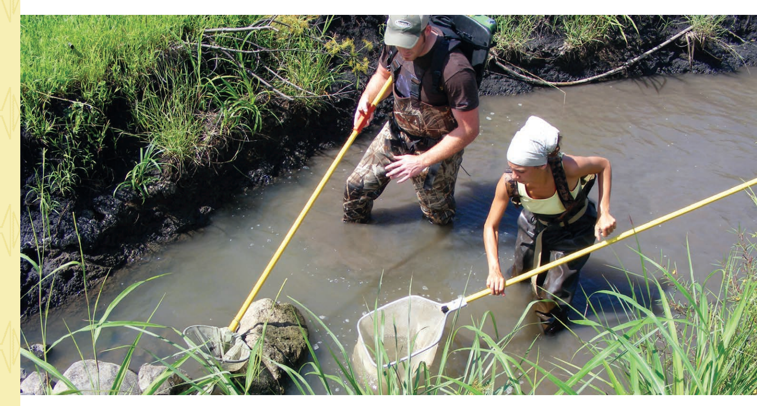
Applied Learning: Environmental Science students participate in a research immersion program on reptile projects in the Palo Verde National Park Tropical Dry Forest of Costa Rica, Sitting Bull College.

Breaking Through has developed four strategies that are proving to be highly effective in 40 mainstream community colleges. These strategies hold tremendous potential for success within TCUs, which serve communities that have high percentages of adults requiring developmental education before entering the workforce. The contextualization of developmental education curriculum to incorporate job readiness skills and career information and the provision of comprehensive student support services is already happening at many TCUs. The Breaking Through initiative provides important focus, methods, and tactics that could help TCUs more effectively implement and assess these strategies. The following recommendations can further enhance the Breaking Through success at TCUs.