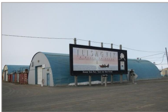
Outdated buildings such as these Cold War-era Quonset huts at Iłisaḡvik College (Barrow, AK) are common at many TCUs.